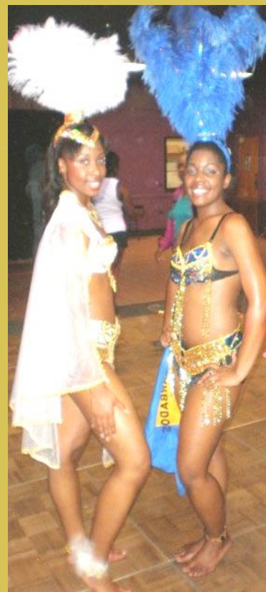
Black Student Union presents, "Fashion Ova-Style, It's a Caribbean Thing."