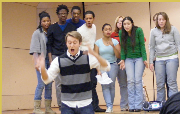
Concentric Stories, a performance for the Rev. Dr. Martin Luther King, Jr. Commemoration