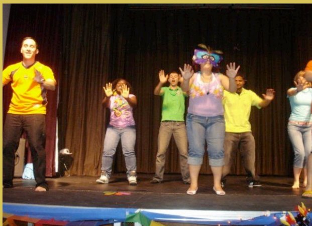
2008 Sabor Latino: "Carnaval Sabroso," sponsored by the Latino Student Association