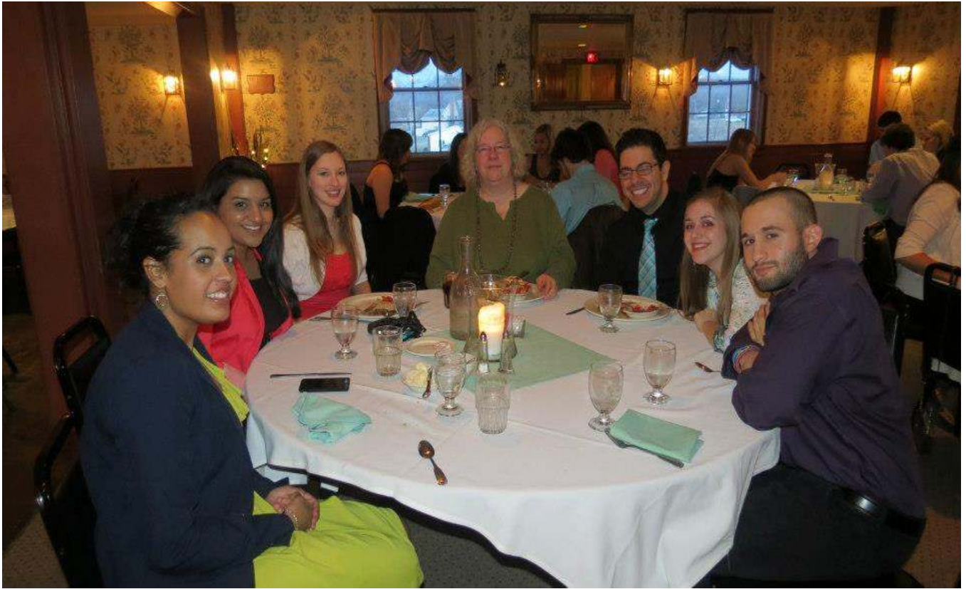
SPRG's First Formal this Spring at Yard of Ale