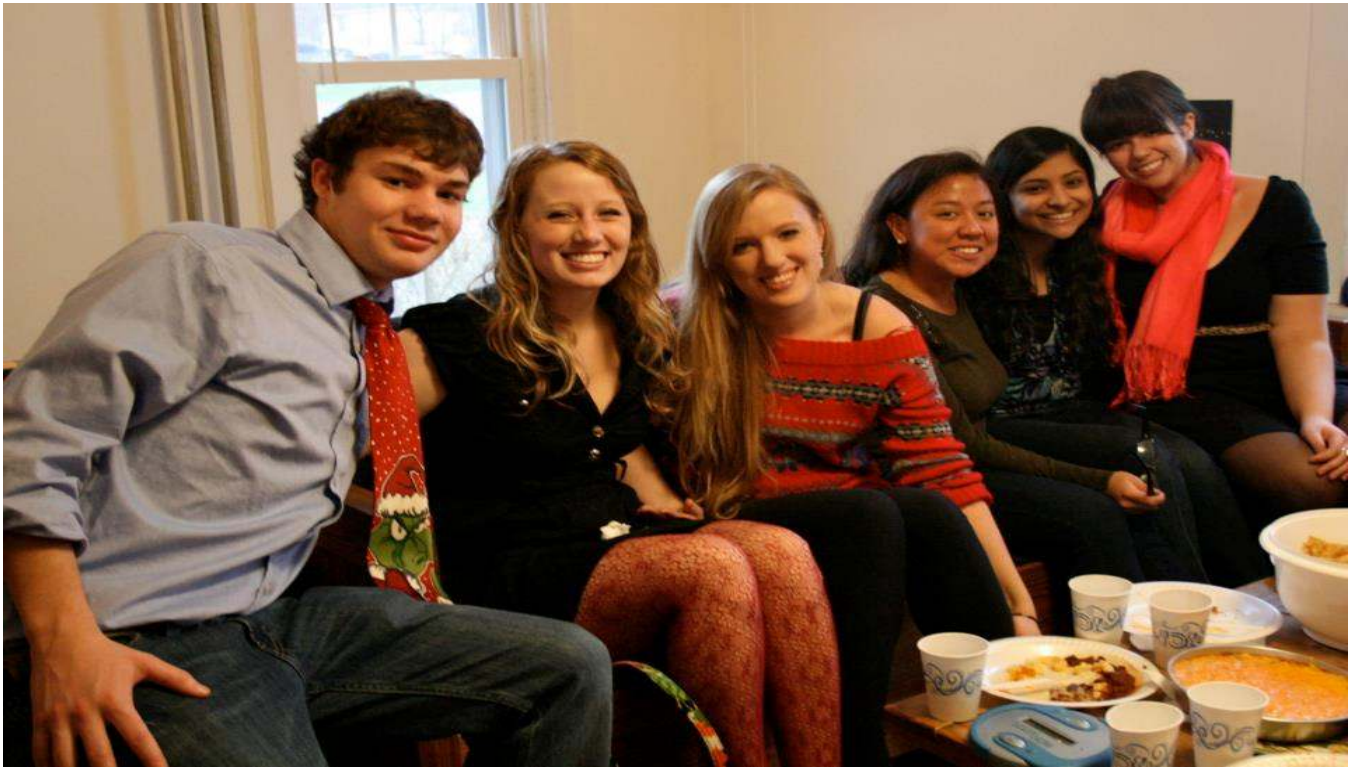
SPRG's Holiday Party!