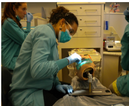
Using skills learned at SMDEP to perform a filling.

then accepted to the University of Nebraska. My journey to Nebraska was quite an experience, and a true grand opportunity. The program consisted of many lectures within all main science courses such as Biology, Chemistry, and Physics, but on the other hand there were lectures on study skills and how to apply to medical and dental school. It was tough having these classes over the summer but it was definitely worth sacrificing for especially when your