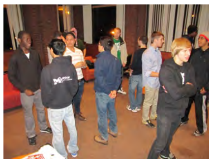
MILES members during a meeting.