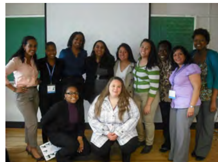
WLI at GREAT Day.

Director of Women and Population for the United Nations Foundation.