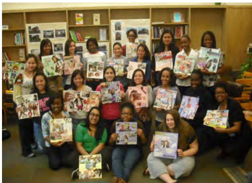
WLI Participants with their Vision Boards