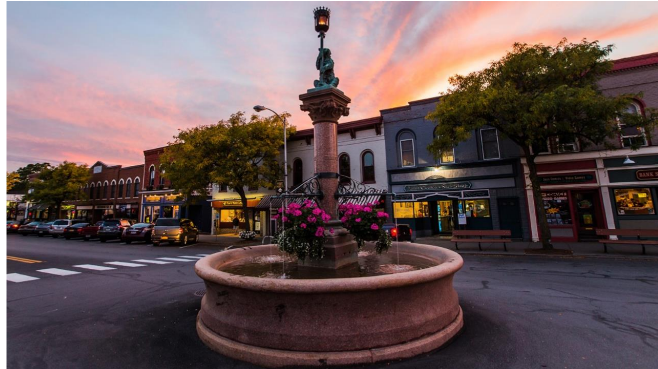
Main Street, Geneseo