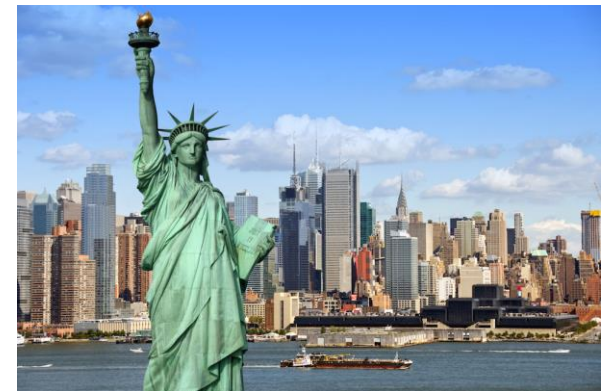
New York, NY