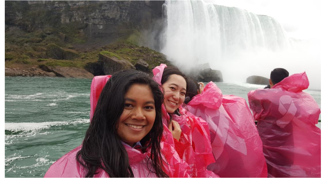
Trip to Niagara Falls, Pot Luck, International Student Peer Mentors