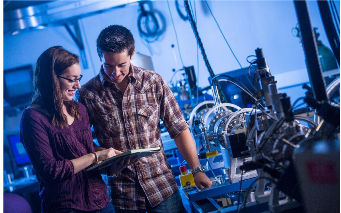
Pelletron Particle Accelerator