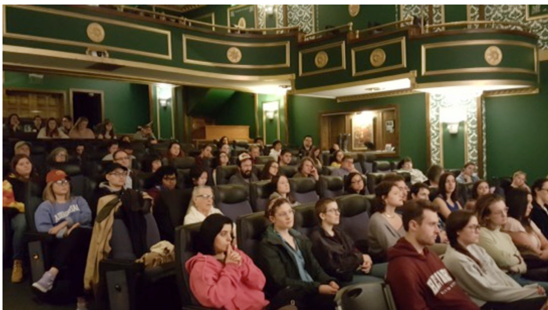
Students at Riviera Presentation of Who Speaks for Nature