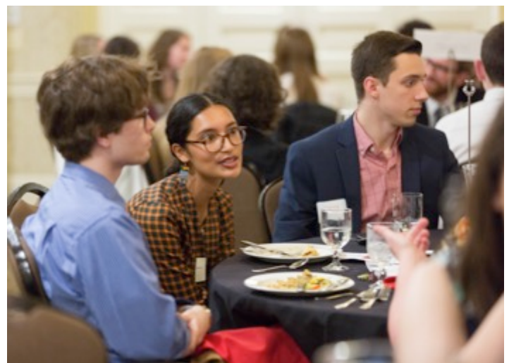
Poli Sci and IR Dinner