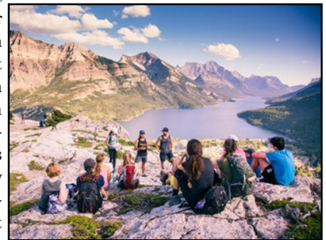
Students on a geography field trip to the Canadian Rockies in 2016