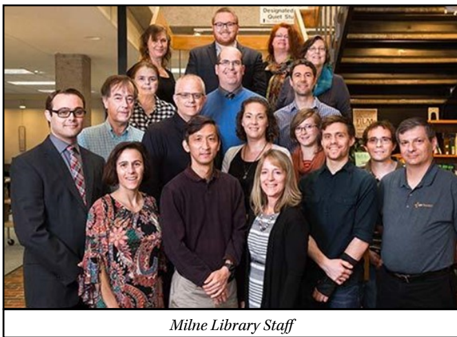
Milne Library Staff

Milne was cited for the strength of its programs in five categories: Creativity, Innovation, and Leadership; Research Instruction Program; Outreach and Community Engagement; Experiential Learning; and Responsiveness to the Community. The library also was commended for its strong commitment to open access to scholarship and educational resources, the Summer Library Research Academy, and ongoing work with local high schools.