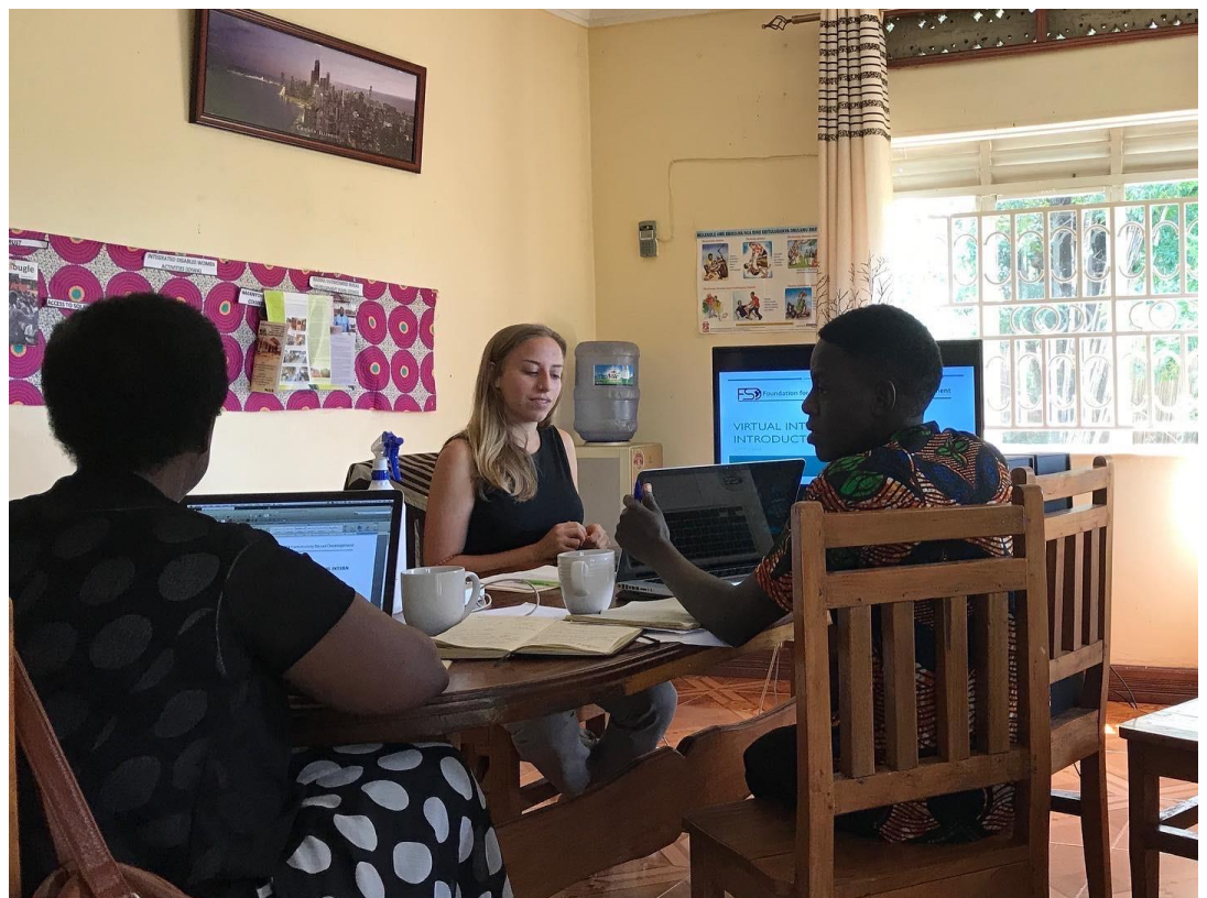
Figure 1: FSD Site team leading a workshop with the virtual students using Zoom