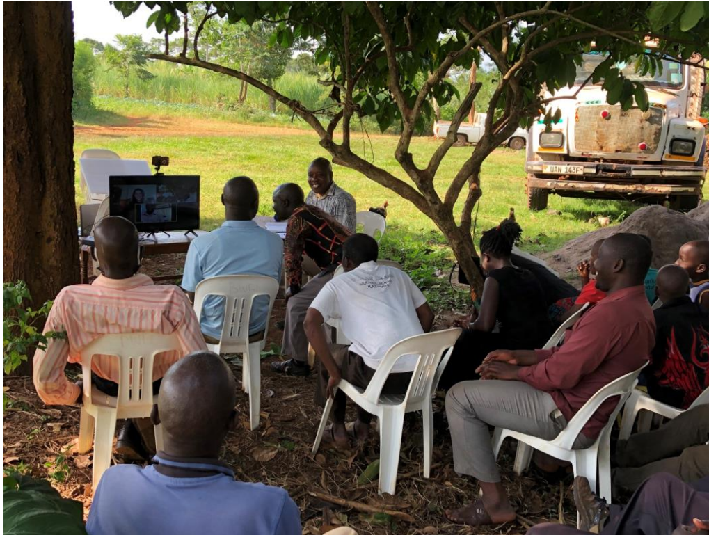
Figure 2: Community Assessment from Summer 2020. A student has called in virtually to meet the community in their local village. The student and the host supervisor developed a discussion focus group to start engaging with the group of Busoga sugarcane farmers.