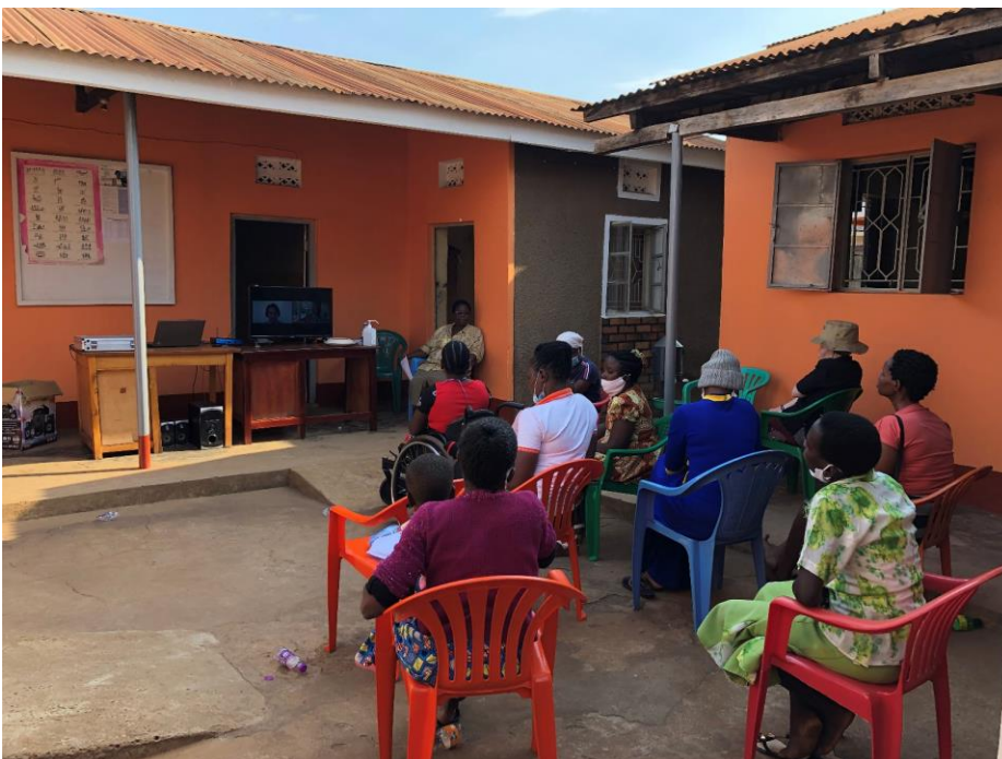
Figure 1: A student is introduced to the host organization and some community members during the summer virtual internship.